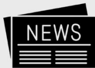
Traditional Print Media