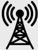
Radio & TV Broadcasting